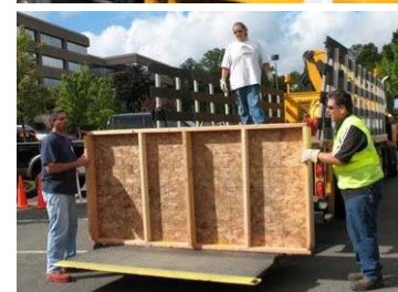
UI employees deliver the walls to build Harvest House